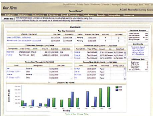
The Dashboard provides a detailed overview of your payroll situation.

Our complete payroll service supports a wide range of pay types and schedules, and includes check printing, direct deposit, tax filings, complete compliance and more. Automatic reminders keep you informed of due dates for tax payments and compliance reports, and you will receive all the payroll reports you need to run your business most efficiently. In addition, you also get personalized professional advice on all payroll matters.